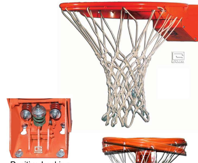
Positive Locking Multi-Directional Spring