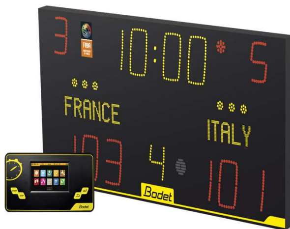
Essentials SB-F3A (Digital Team Names/Messaging model)