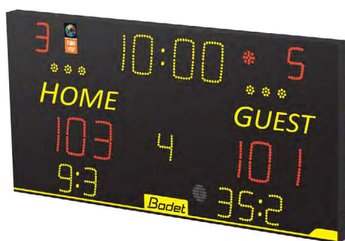
Essentials SB-F3 (Home/Guest model)

Includes wireless touch scorepad controller.